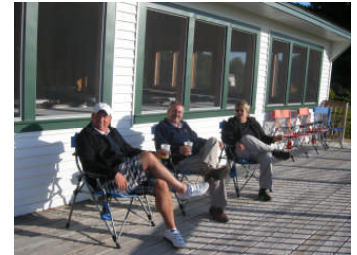
KVBR Leadership in repose...