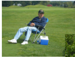
A lonely job...