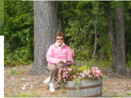
But a huge thanks