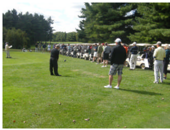
And so it begins...FORE!

The Eleventh Annual KVBR Golf Tournament at the Natanis Golf Course in Vassalboro was a huge success! Thanks to all who participated. Volunteers and golfers alike. $6,200 Raised for our local charities!